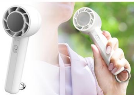
Portable handheld fan (with cooling function)

A unique, out-of-the-box approach to home appliances. They are created by reexamining our daily lives.