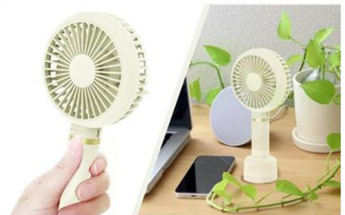
Portable handheld fan